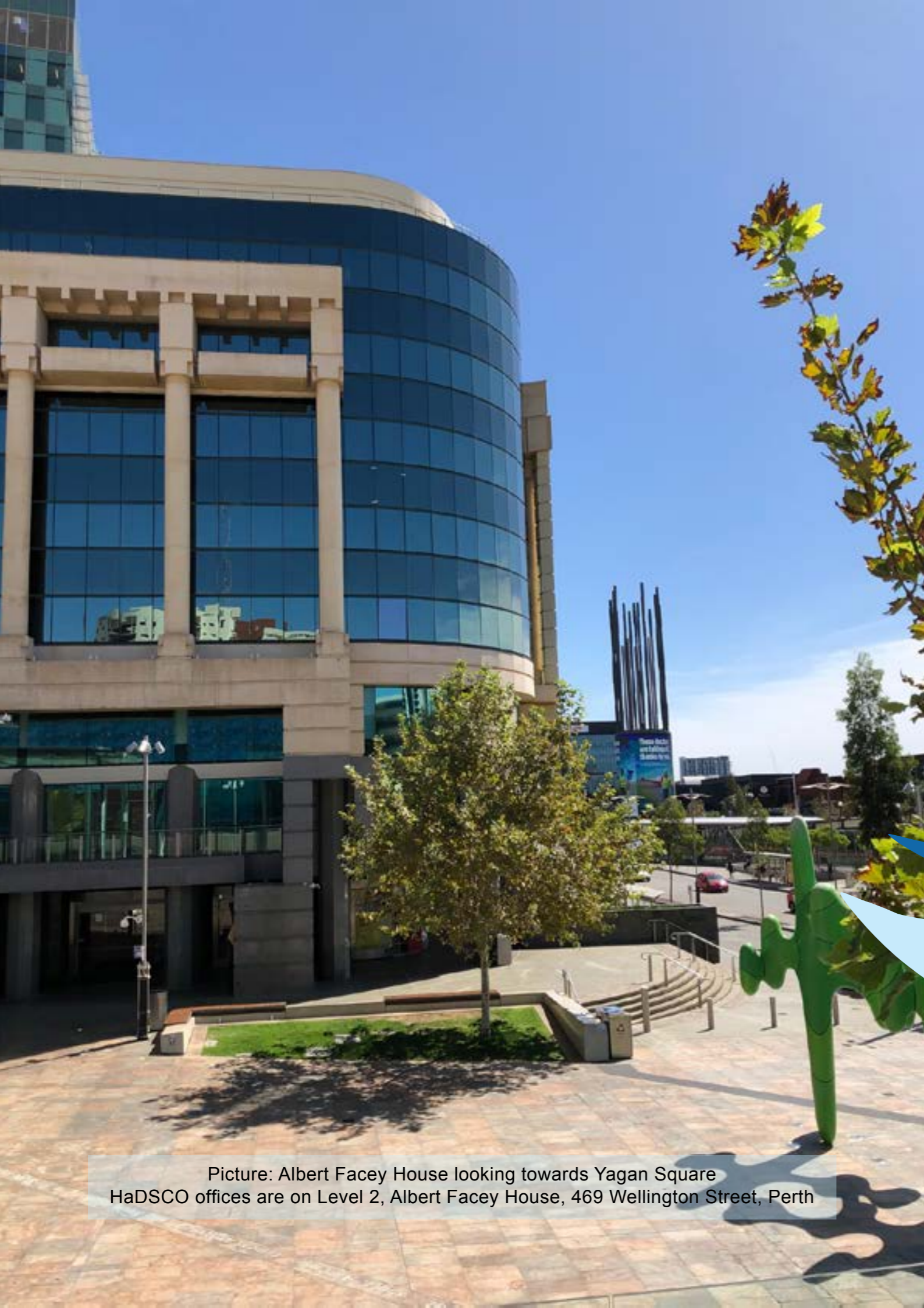
Picture: Albert Facey House looking towards Yagan Square HaDSCO offices are on Level 2, Albert Facey House, 469 Wellington Street, Perth